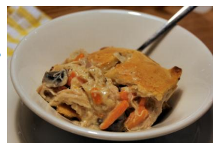
Chicken & Mushroom Pie

How to get hold of our delicious farmhouse meals