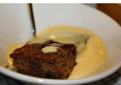
Sticky Toffee Pudding

Or if you prefer telephone us with your order on,