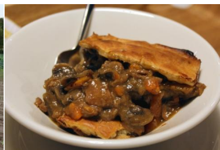
Beef and Mushroom Pie