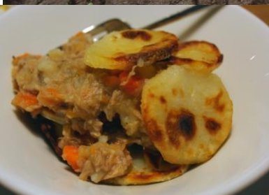
Lancashire Lamb Hot Pot

All our meals are handmade on our farm and frozen to seal in the taste. We use fresh vegetables that are grown on the farm, and the quality meat we use comes from local farms, cooked with traditional ingredients giving our food a real home cooked taste.